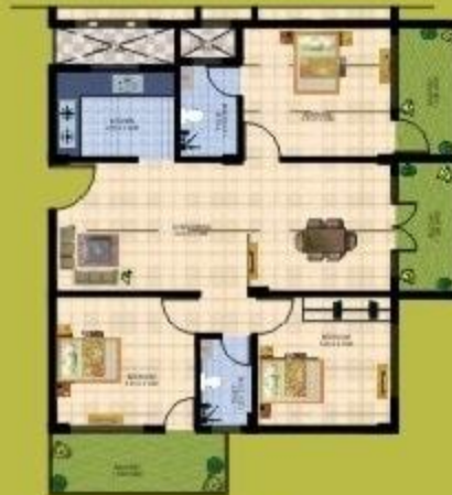
UNIT - 40