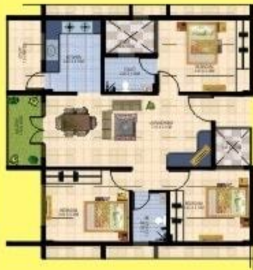
UNIT -2, 3, 4 & 5