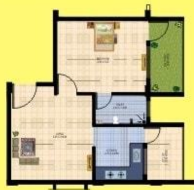
UNIT - 24