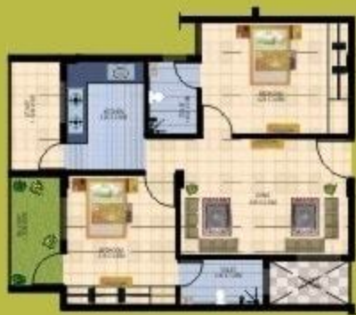
UNIT - 8, 9, 10 & 11