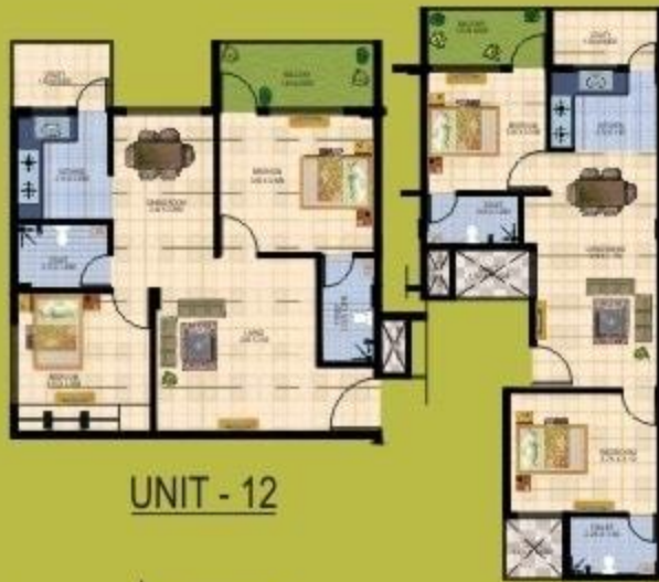
UNIT - 12