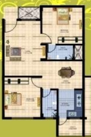
UNIT - 31