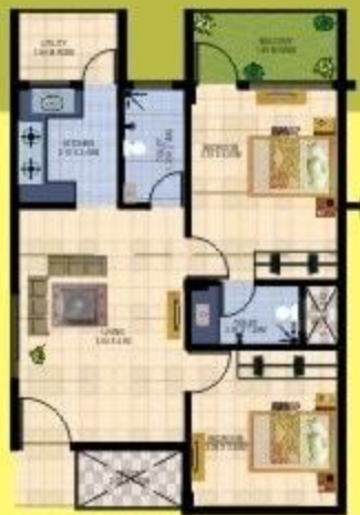
UNIT - 17, 18, 19, 20, 21 & 22