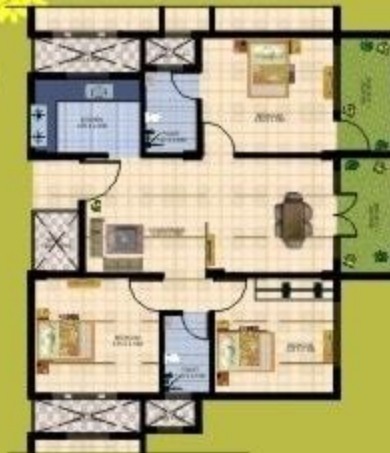
UNIT - 39