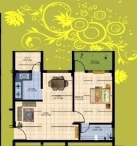
UNIT - 15